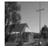
St Anne's, Bindoon

The Community of Our Lady of the VISITATION PARISH comprised of four centres: Gingin, Bindoon, Bullsbrook & Maryville; Welcomes you to the celebration of Holy Mass