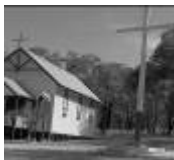
St Catherine's, Gingin

The family that prays together, stays together. A family at prayer is a family at peace!